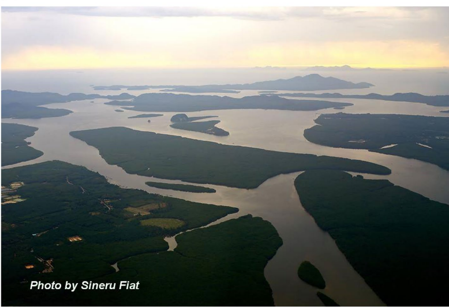
Figure 2. (a) The EGAT's existing thermal power plant near (b) the Krabi estuary, renowned as a Ramsar site and a very popular tourist destination.

production capacity of 626 MW each. The coal projects are being developed by the Hongsa Power Company, a consortium comprised of the Thai company, Ratchaburi Electricity Generating Holding Public Company, Banpu Power (a subsidiary of the Thai coal-mining company, Banpu), and Lao Holding State Enterprise.