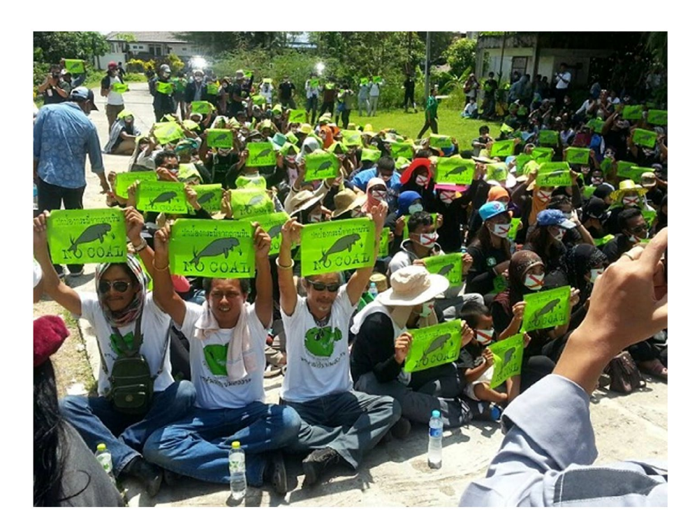
Figure 4. Approximately 300 villagers took the opportunity to express their opposition after they were denied access to the meeting room because it was allegedly full, mostly with supporters.

As expected, without any intervention or monitoring of the consultant during the EIA process, the number of conflicts between the consultant and local villagers invariably rose. Eventually, the assessment moved to the final phase, the public review, and the consultant sent invitation letters directly to the villagers. All the interviewees acknowledged the notification this time. The local people wanted to participate in the public hearing to express their opposition to the project. However, a local activist supporting the locals said that: