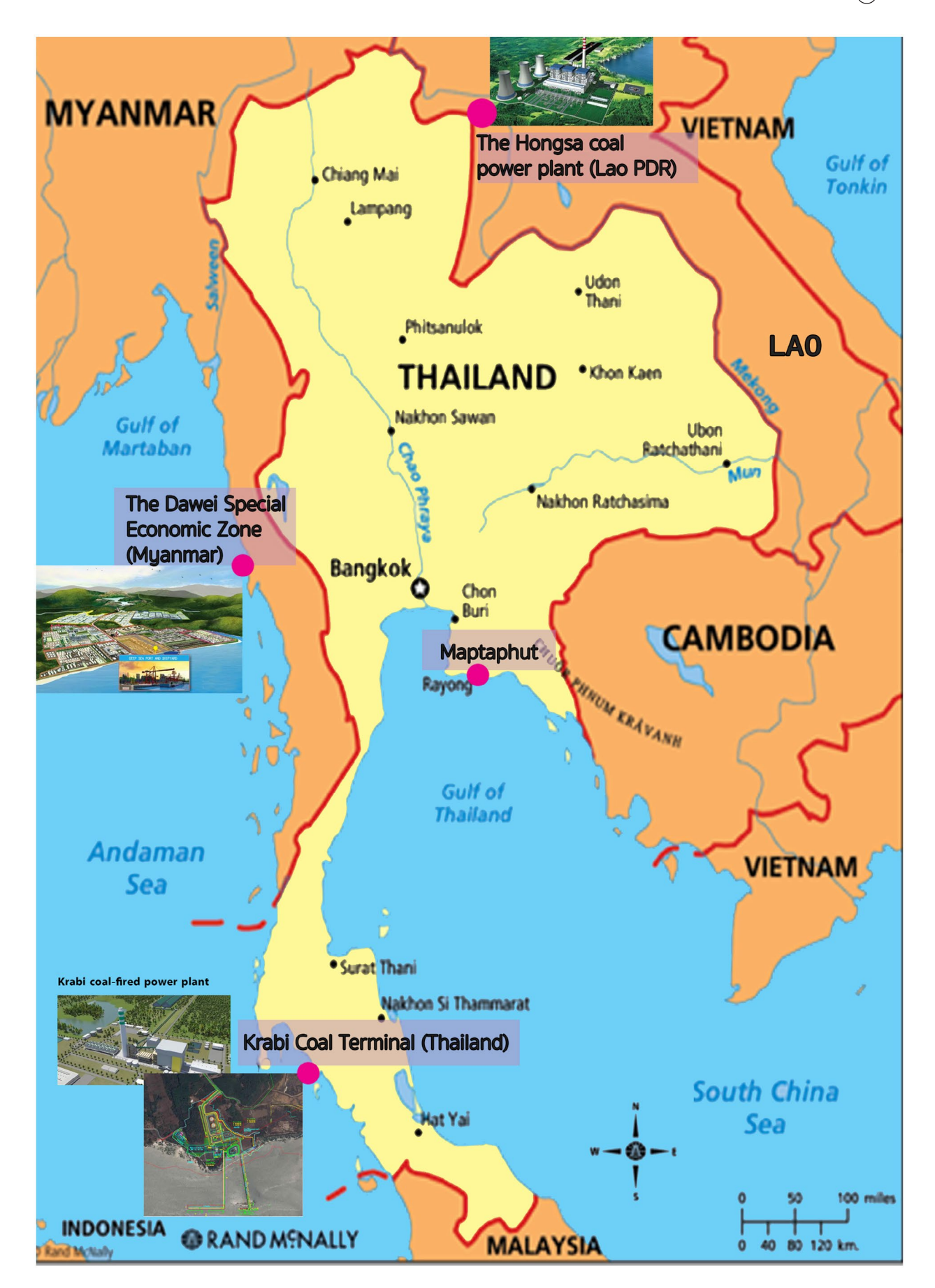
Figure 1. The three Thai investment projects in this study, namely, Krabi coal terminal (Thailand), the Hongsa coal-fired power plant (Lao PDR), and the DSEZ (Myanmar).